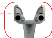
Felge: Frontansicht I Rim: front view